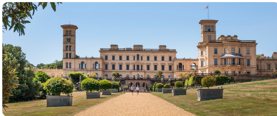
Osborne House is on the Isle of Wight, England. This was Queen Victoria's favourite holiday home.