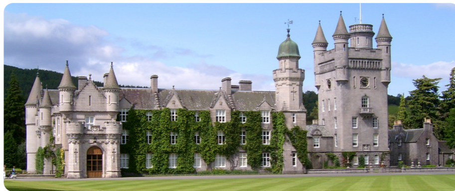
Balmoral Castle is in Aberdeenshire, Scotland. It is used mainly as a holiday home for the Royal Family.