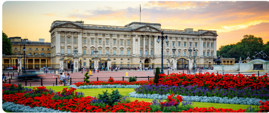
Buckingham Palace is in London, England. It is the Queen's main residence.

Royal residences include palaces, castles and stately homes. Some of them are used for official royal business and some are used as holiday or private homes.