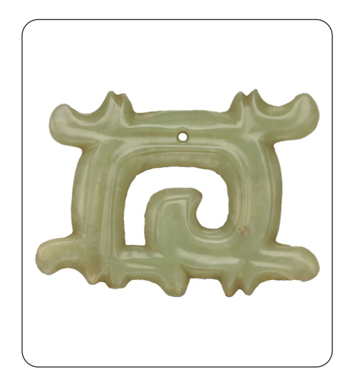
jade plaque, c3500-c2000 BC

Jade is a hard and rare stone, made from the mineral nephrite, which is difficult to shape and carve. Jade was used for jewellery, ornaments, weapons, tools and ritual objects. It was precious and a symbol of purity and virtue.