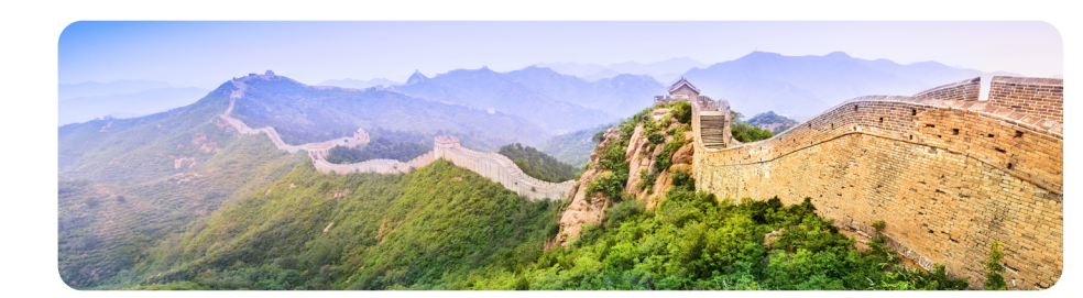
Great Wall of China

During the Zhou Dynasty, power moved from the king to the feudal lords of individual states. Iron began to replace bronze, and warfare advanced with crossbows and horses. Confucius also created his influential philosophy of Confucianism. Seven states fought for power during the Eastern Zhou Dynasty. The Qin Dynasty united the warring states and introduced the first emperor of the whole of China, as well as a new government structure. Building also began on the Great Wall of China, and the Terracotta Army was made. The Han Dynasty developed an advanced system of government and opened the Silk Road trade route, which connected China with the western world.