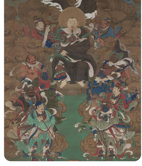
Shangdi surrounded by attendants