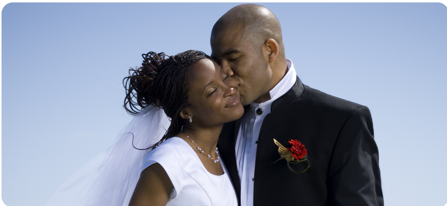
Weddings happen when two adults get married.