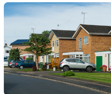
A street today.