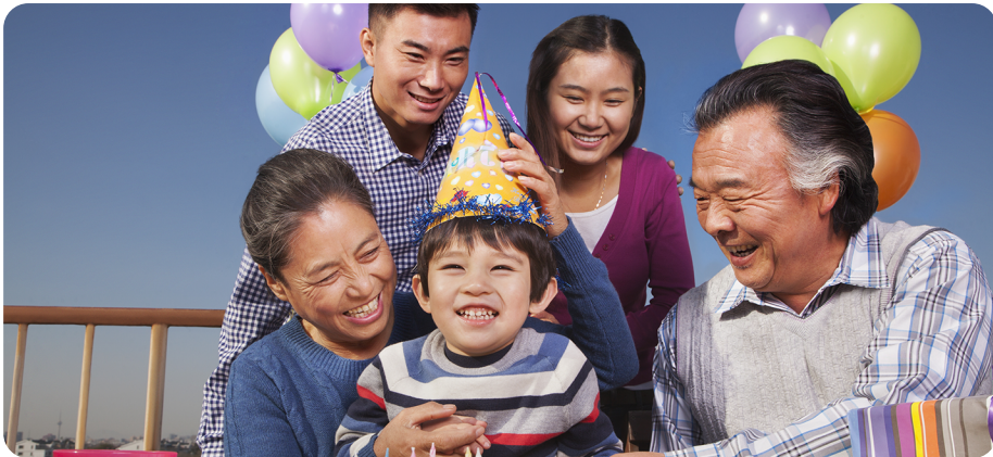
Birthdays happen every year.

Important life events include birthdays, religious festivals or family celebrations. Some life events happen every year and some happen at certain stages of human life.